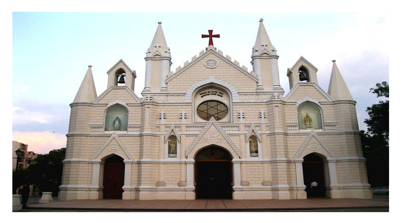
Patrick's Cathedral Church