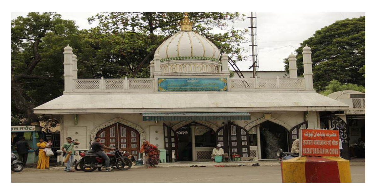
Hajrat Babajan Dargah

Famous as "Oxford of the East" – Higher Education institutes in Pune attracts International Students mainly from the Middle Eastern countries such as Iran, and United Arab Emirates, and also African countries such as Ethiopia and Kenya. Pune is the largest centre for Japanese learning in India. Other languages taught in the city includes German