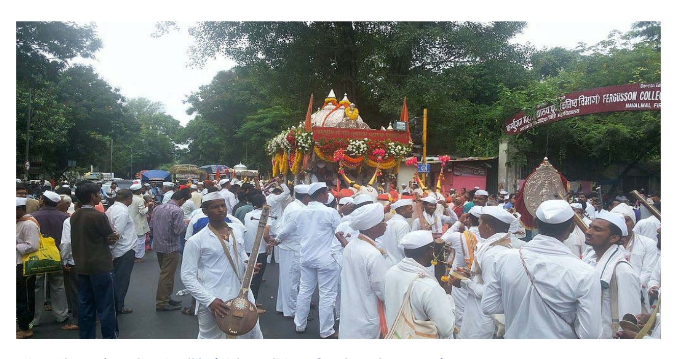
Saint Tukaram's Maharaj Palkhi (Rich Tradition of Maharashtra State)